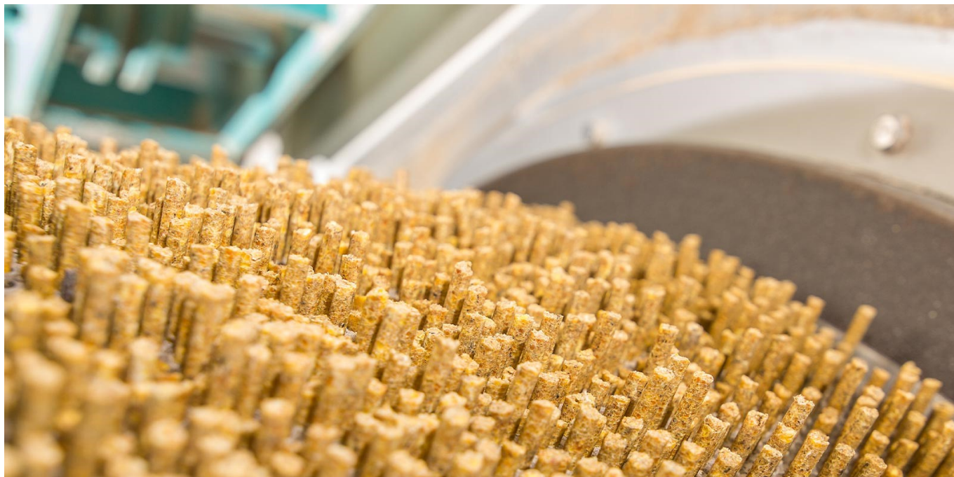
Feed mills are critical sites for biosecurity measures in poultry production

A physical barrier or sign indicating a biosecurity area on a farm or building entrance can help remind people of the program. Of course, these signs will not stop a disease from entering, nor a person determined to enter a site, but they will cause well-trained people to pause and reflect if they are making a sound decision.