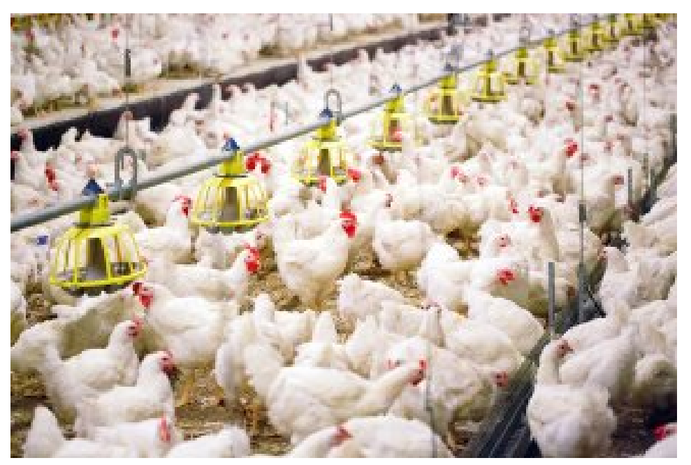
Relatively high stocking density is the norm in poultry production

The build-up of mucus in the respiratory tract severely reduces oxygen intake, causing breathlessness, reduced feed intake, and a drop in the birds' energy levels, which negatively impacts weight gain and egg production. Respiratory problems can result from infection with bacteria, viruses, and fungi, or exposure to allergens. The resultant irritation and inflammation of the respiratory tract leads to sneezing, wheezing, and coughing – and, therefore, the infection rapidly spreads within the flock.