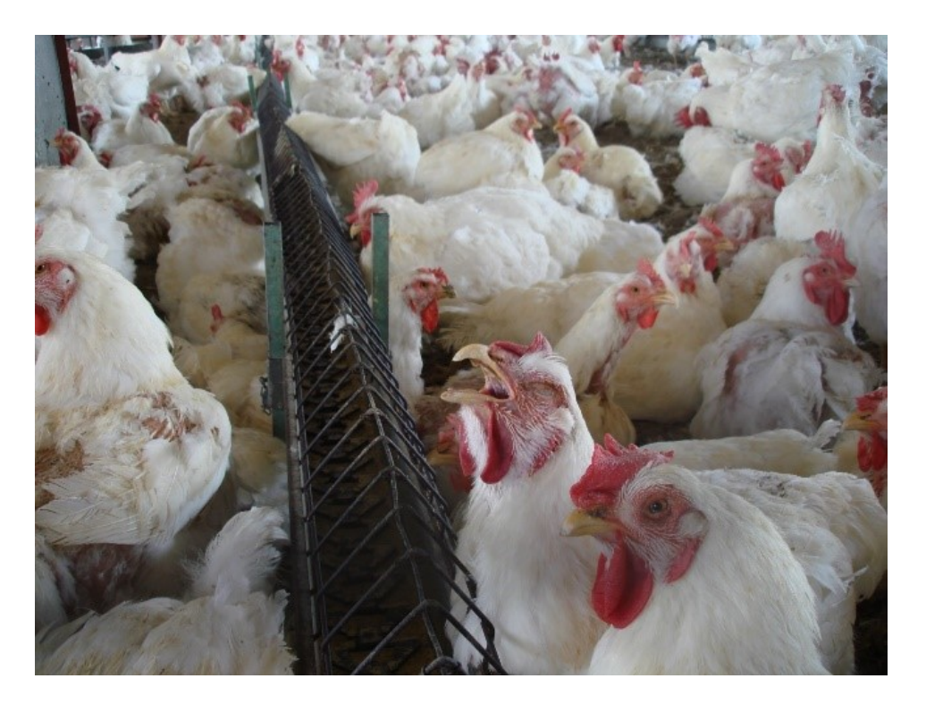
Clinical signs of respiratory disease in chickens include coughing, sneezing, and rales

Thyme oil, thanks to the phytomolecules thymol and carvacrol, supports the treatment of respiratory disorders. These substances smooth tightened muscles and stimulate the respiratory system. An additional advantage lies in their expectorant and spasmolytic properties (Edris, 2007).