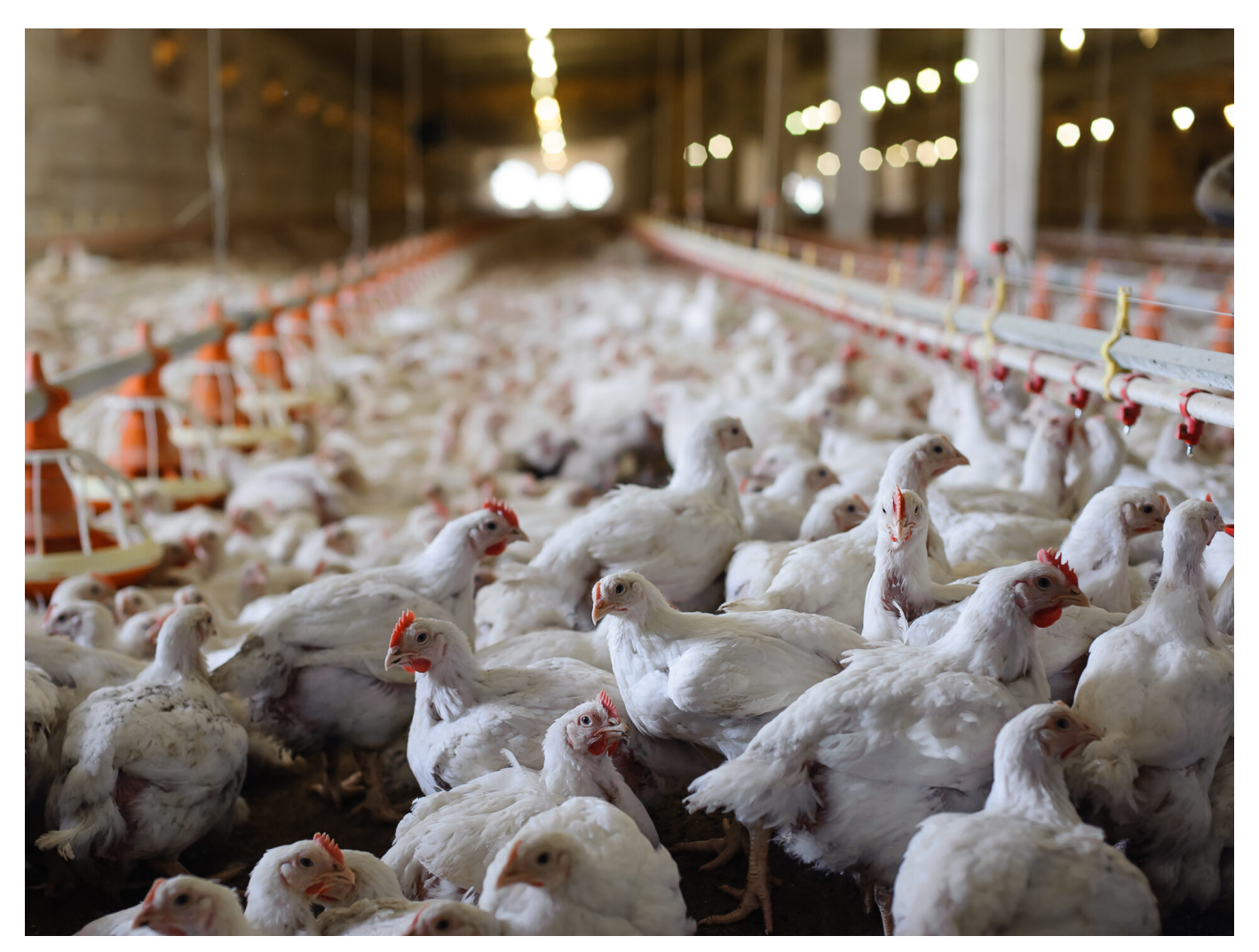
by Predrag Persak, Regional Technical Manager North Europe, EW Nutrition

The main sustainability challenge for broiler production lies in securing enough high-quality, nutritious, safe, and readily available food at a reasonable cost. At times, feed ingredients have to be included that are not nutritionally ideal and might compromise one's broilers' health and wellbeing. However, counteracting this threat with prophylactic antibiotics is not acceptable: We must minimize the use of antibiotics to mitigate antimicrobial resistance. The way forward is to go beyond static and linear nutritional value-to-price thinking. A dynamic nutritional strategy focusing on the interdependencies between ingredients, gut, microbiome, and digestion, enables sustainable ABF broiler production.