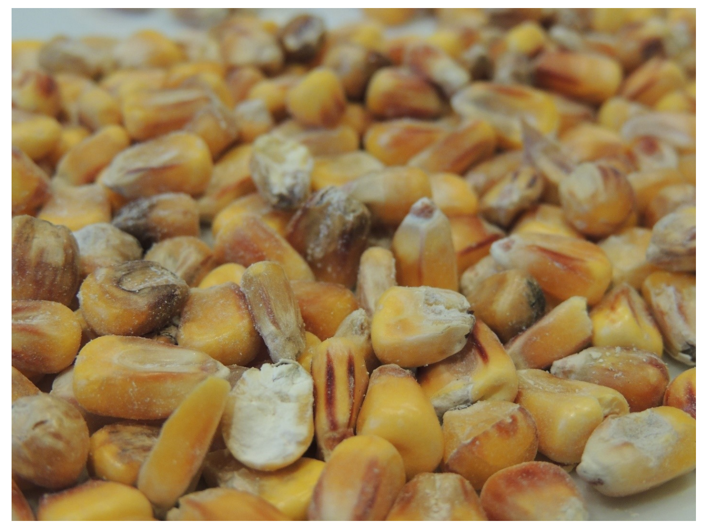
Mycotoxin contaminated-feed can damage production animals' performance, health, and welfare

When striving for a sustainable ABF broiler production approach, the possibility for errors becomes higher, while the error margin becomes smaller. The solution lies in helping the animals to mitigate the impact of stressors by focusing on the interaction of ingredients, gut, microbiome, and digestion. It is a holistic approach centered on gut health. Keeping the intestines BEAUTIful will help you produce in challenging conditions without the use of antimicrobials.