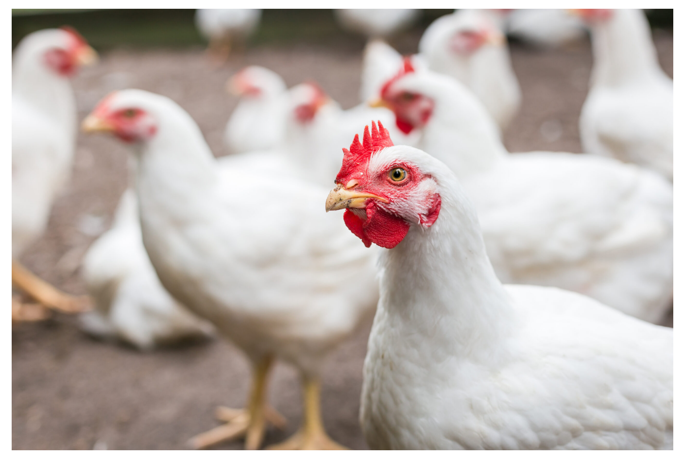
Sustainable ABF broiler production requires a dynamic, gut health-oriented nutritional strategy