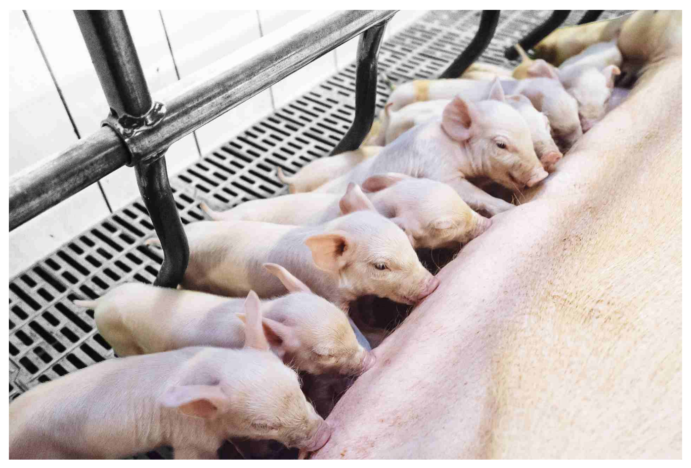
By Technical Team, EW Nutrition

As pig production specialists, we understand that our animals are under constant challenge during their life. Challenges can be severe or moderate, correlated to several factors - such as, for instance, stage of production, environment, and so on - but they will always be present. To be successful, we need to understand how to counter these challenges and support the healthy development of our pigs.