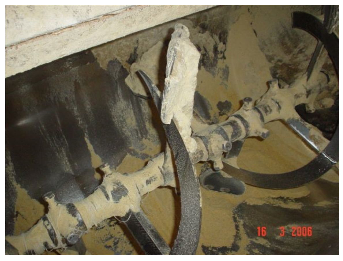
Figure 2. Feed mixer in a home mixer pig farm