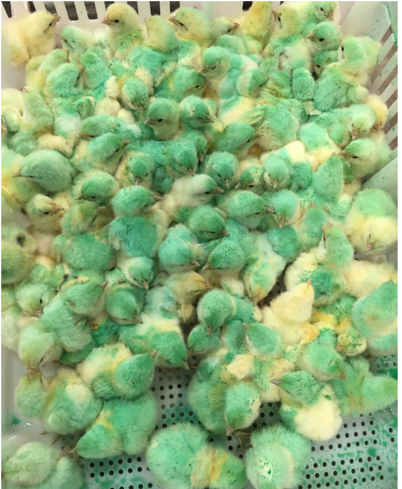
A dye helps to evaluate if the coccidiosis vaccine was evenly sprayed across all chicks.