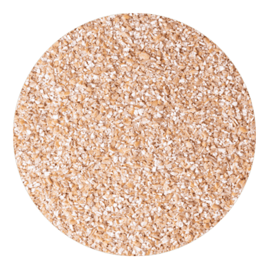
Wheat milling by-product