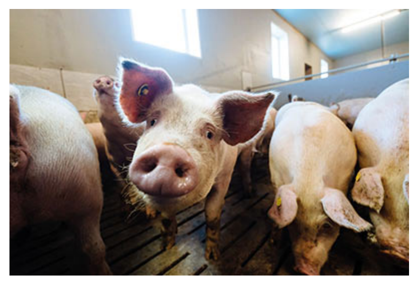
Pigs are susceptible to antinutritional factors

When by-products are fed to pigs, swine nutritionists have reported that many of them can support pig growth and finishing performance and meat quality as well as immune response, milk yield, and milk quality in reproductive animals, among other productive parameters (Yang et al., 2021). For instance, Dong et al. (2019) concluded that, from a nutritional perspective, ingredients such as highland barley, buckwheat, glutinous broomcorn millet, non-glutinous broomcorn millet, and Chinese naked oat could potentially substitute corn in livestock feeding. Or as another example, Liu et al. (2019) suggest in their study that mulberry leaf can contribute to improvements in meat quality, with no adverse effects on the growth performance of finishing pigs. (Dong et al., 2019).