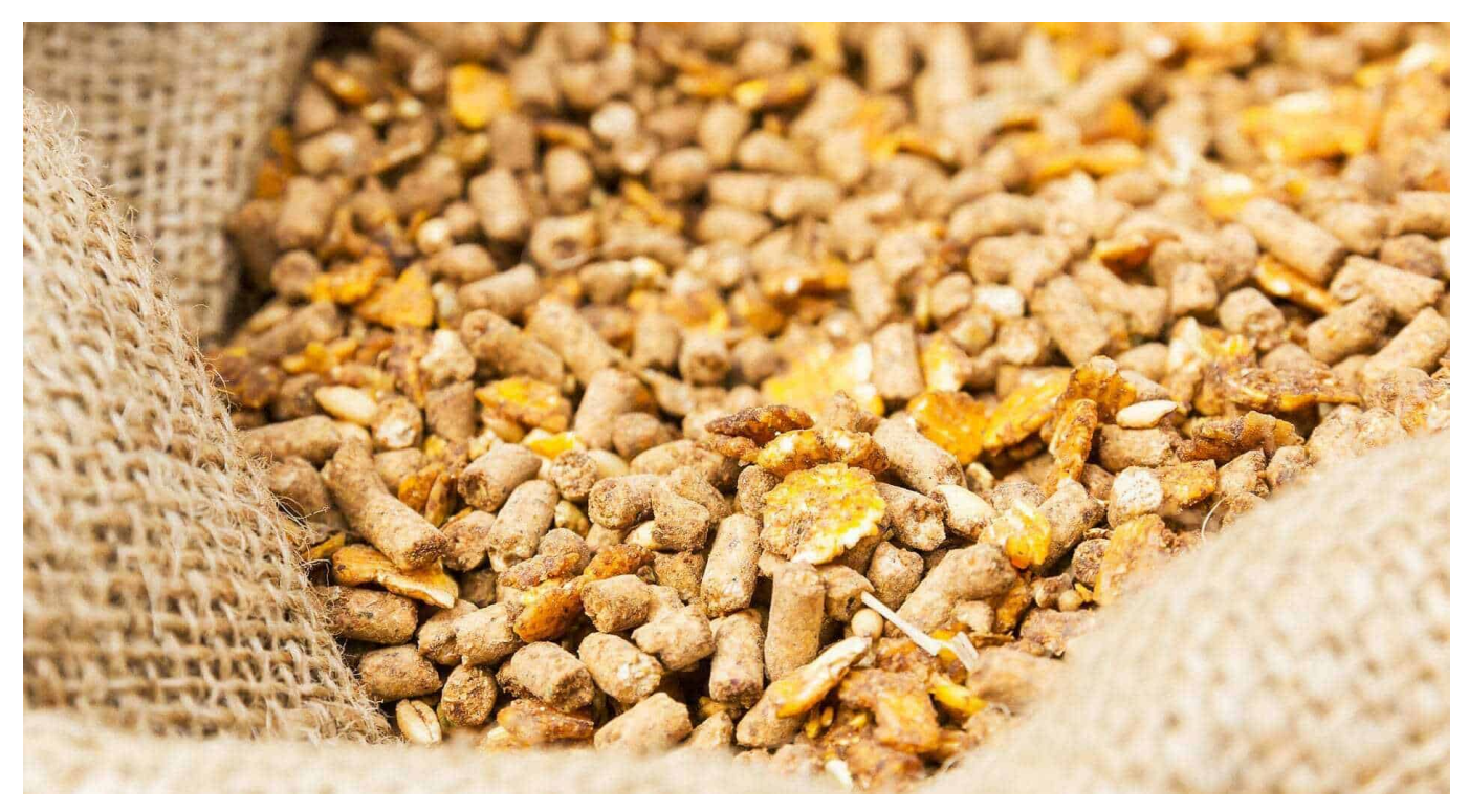
By Marisabel Caballero, Global Technical Manager Poultry, EW Nutrition

More than five months after the start of the war in Ukraine, we are facing severe challenges in many aspects of our daily lives. The livestock industry is not excepted: the conflict affects the availability and prices of grains, fertilizers, oil, and biofuel, with the latter two having a direct impact on freight rate and shipping time.