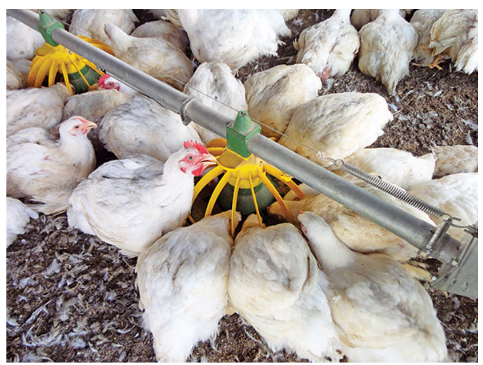
Several factors must be considered when using by-products in poultry nutrition

In summary, to use by-products in poultry diets, their cost, availability, nutritional composition, antinutritional factors, quality, as well as interaction and cost-effectiveness with feed additives (e.g., enzymes, toxin binders) must be considered to avoid or diminish the factors hindering animal health and performance.