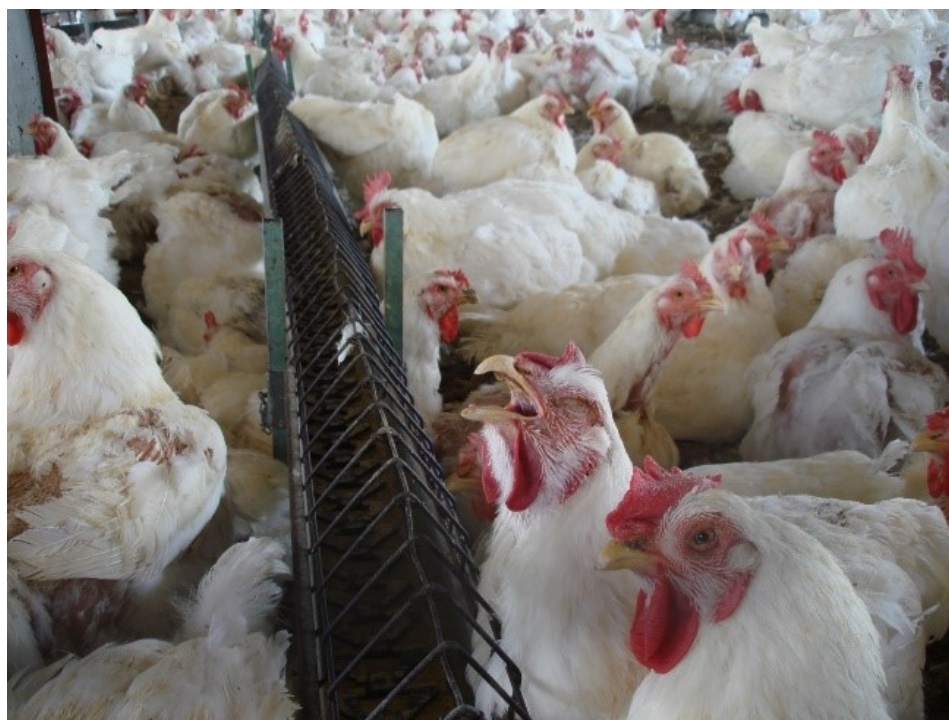
Clinical signs of respiratory disease in chickens include coughing, sneezing, and rales

In poultry production houses, especially in summer, high temperatures and low humidity increase the amount of air dust. Under such conditions, respiratory tract disorders in broiler chickens, including the deposition of particulates, become more frequent and more severe.