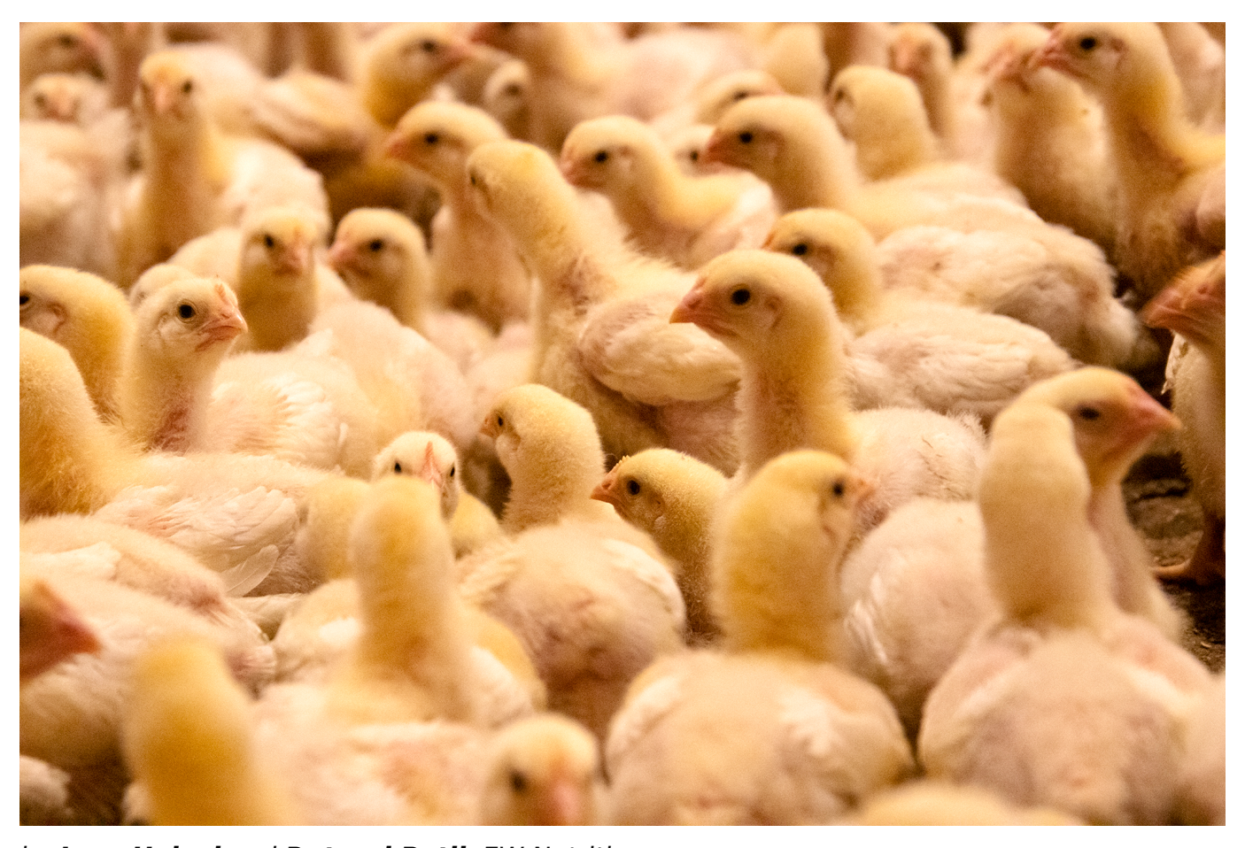
by Inge Heinzl and Ruturaj Patil, EW Nutrition

Broilers face high respiratory disease risks. In winter, they often come from lower temperatures; throughout the year, they come from improper ventilation and proximity to manure or infected birds. The confined spaces and lack of proper airflow create an environment conducive to harmful airborne particles and pathogens, significantly compromising birds' respiratory health. In the possible presence of viruses such as ILT (Infectious Laryngotracheitis Virus), IBV (Infectious Bronchitis Virus), AIV (Avian Influenza Virus, NDV (Newcastle Disease Virus), bacteria like Mycoplasma gallisepticum , E. coli , or Chlamydia, respiratory issues are inevitable.