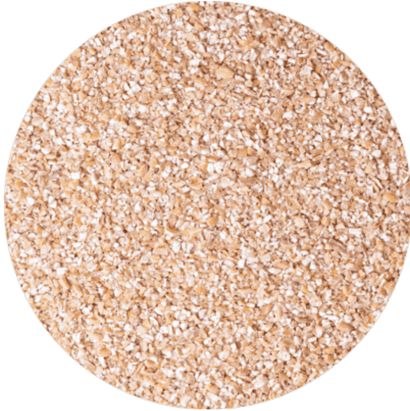
Wheat milling by-product