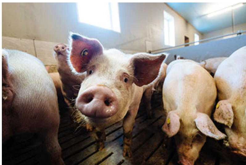
Pigs are susceptible to antinutritional factors

When by-products are fed to pigs, swine nutritionists have reported that many of them can support pig growth and finishing performance and meat quality as well as immune response, milk yield, and milk quality in reproductive animals, among other productive parameters (Yang et al., 2021). For instance, Dong et al. (2019) concluded that, from a nutritional perspective, ingredients such as highland barley, buckwheat, glutinous broomcorn millet, non-glutinous broomcorn millet, and Chinese naked oat could potentially substitute corn in livestock feeding. Or as another example, Liu et al. (2019) suggest in their study that mulberry leaf can contribute to improvements in meat quality, with no adverse effects on the growth performance of finishing pigs. (Dong et al., 2019).