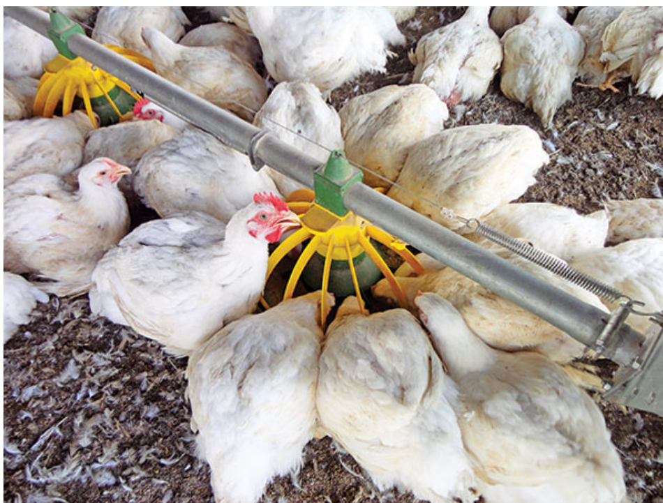
Several factors must be considered when using by-products in poultry nutrition

In summary, to use by-products in poultry diets, their cost, availability, nutritional composition, anti-nutritional factors, quality, as well as interaction and cost-effectiveness with feed additives (e.g., enzymes, toxin binders) must be considered to avoid or diminish the factors hindering animal health and performance.