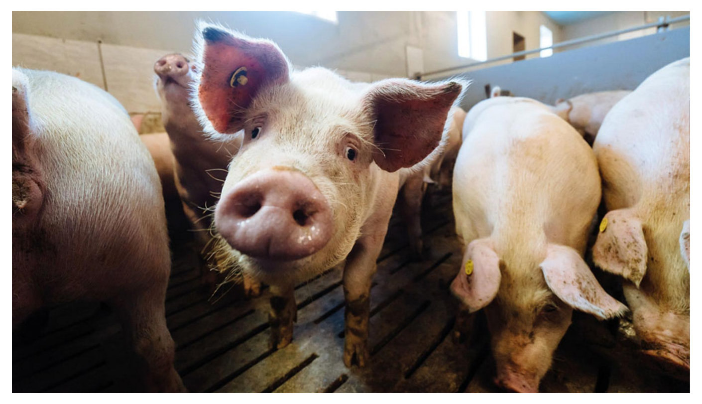
by Merideth Parke, Regional Technical Manager, EW Nutrition

To contain and reverse <u>antimicrobial resistance</u>, consumers and government regulators expect changes in pork production with the clear goal to reduce antibiotic use. For healthy, profitable pig production with simultaneous antibiotic reduction, a <u>holistic strategy</u> is required: refocusing human attitudes and habits, optimal pig health and welfare, and applying potential antibiotic alternatives.