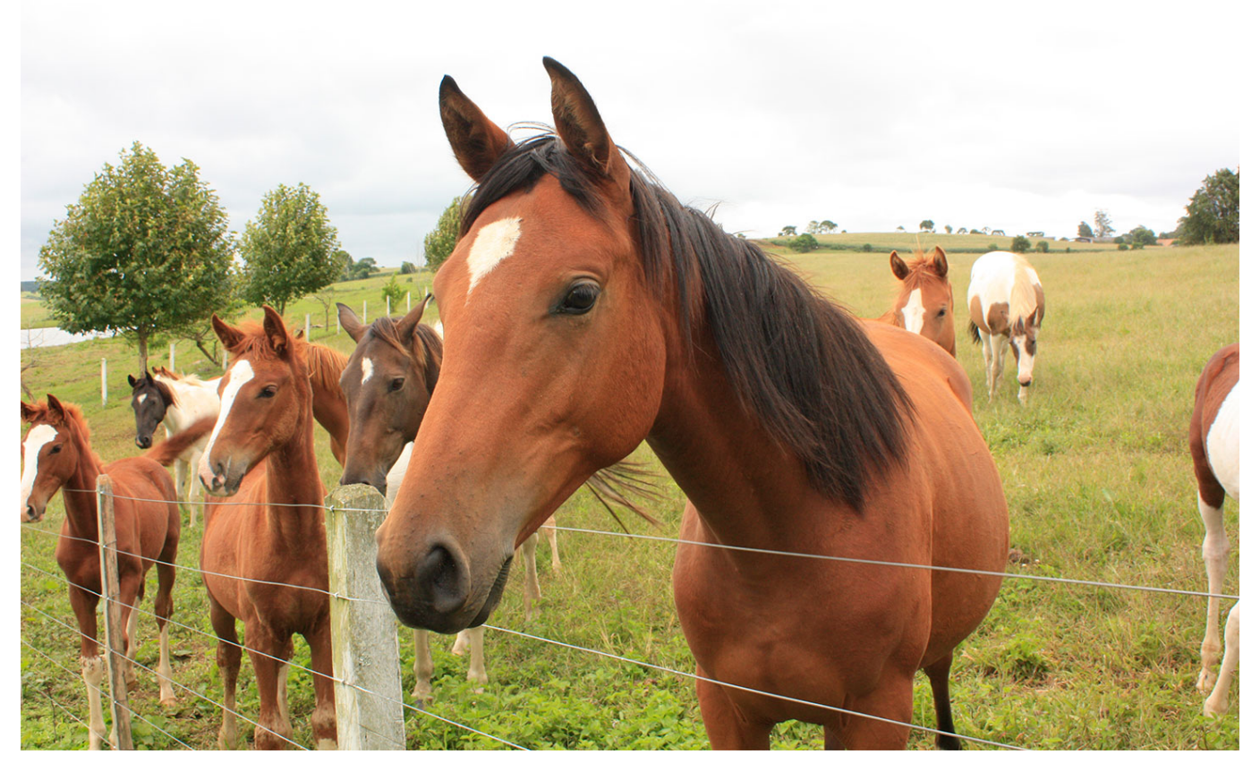
By Judith Schmidt, Product Manager On-Farm Solutions

The respiratory tract in horses is prone to various problems, ranging from allergic reactions and inflammation to severe infections. Respiratory diseases are a constant topic of suffering and irritation in horse breeding and keeping. According to a study published in 2005, respiratory diseases account for about 40 % of all equine internal diseases recorded worldwide (Thein 2005). Through early diagnosis, appropriate treatment, and preventive measures, horse owners can help maintain the respiratory health of their horses and promote their well-being and performance.