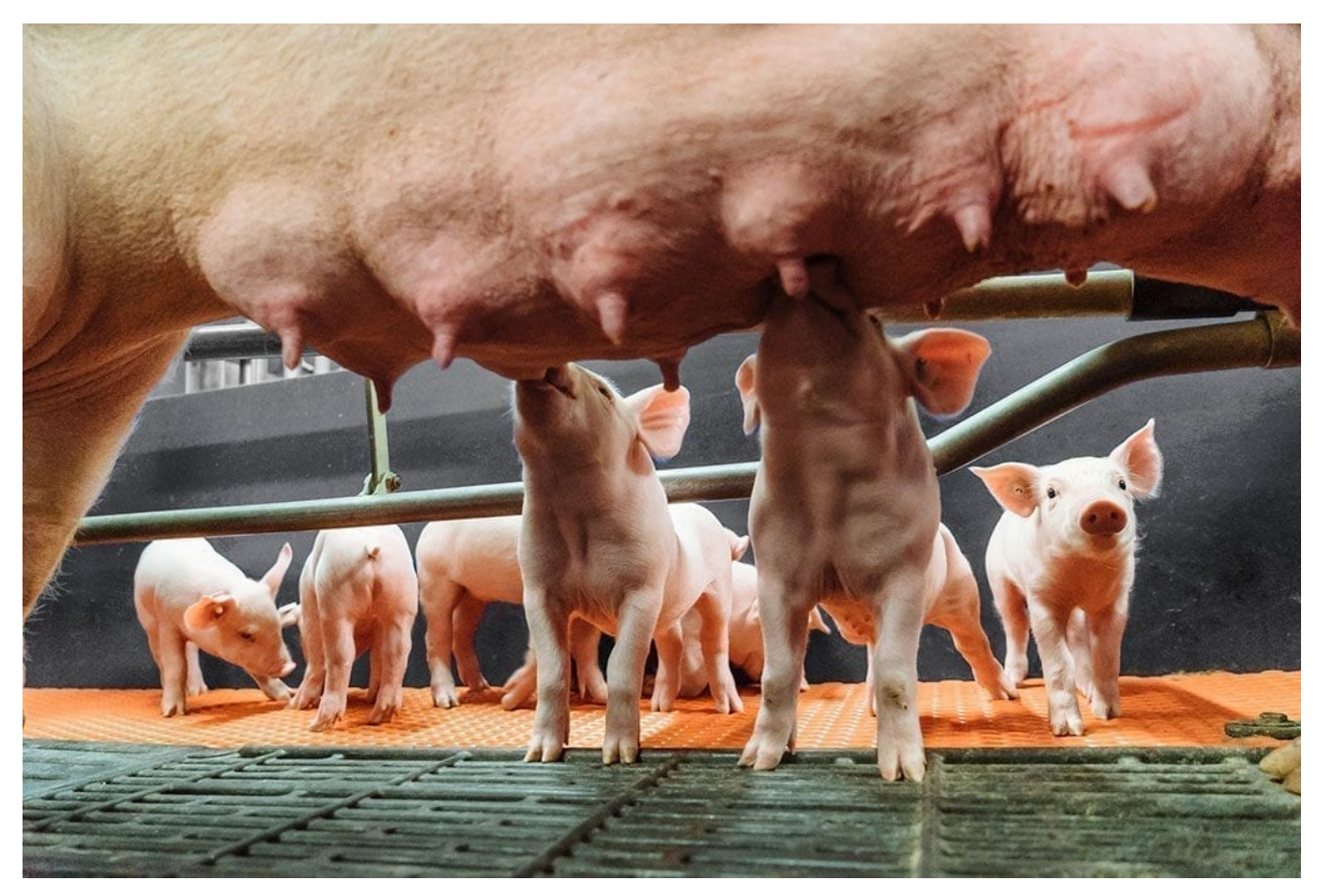
The number of healthy piglets weaned is the most important factor for the calculation of profit in piglet production.

Losses in the farrowing unit normally occur during the first seven days of life as piglets are born with very little protection in the form of immunity. The intake of immunoglobulins from colostrum is therefore of vital importance. Besides cleanliness and special feeding, piglets can be additionally supported by two