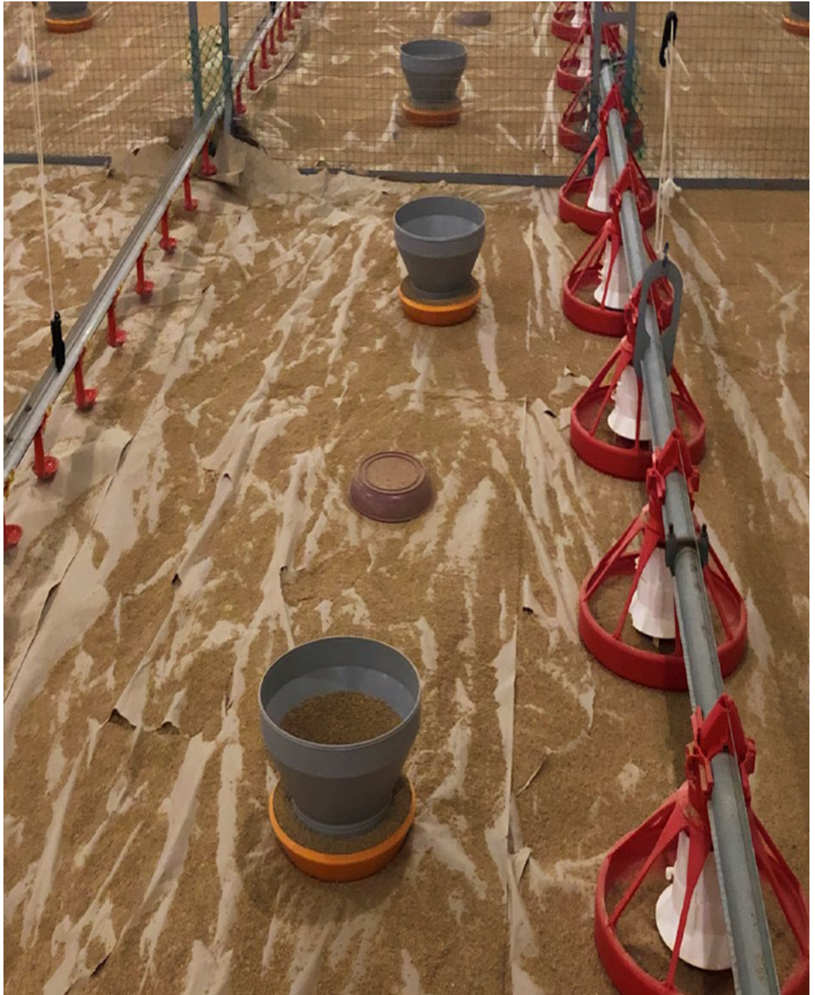
Papered Feed Area

Never place supplemental feed or water directly under or near brooders. Ensure that supplementary feed never runs empty and always remains fresh.