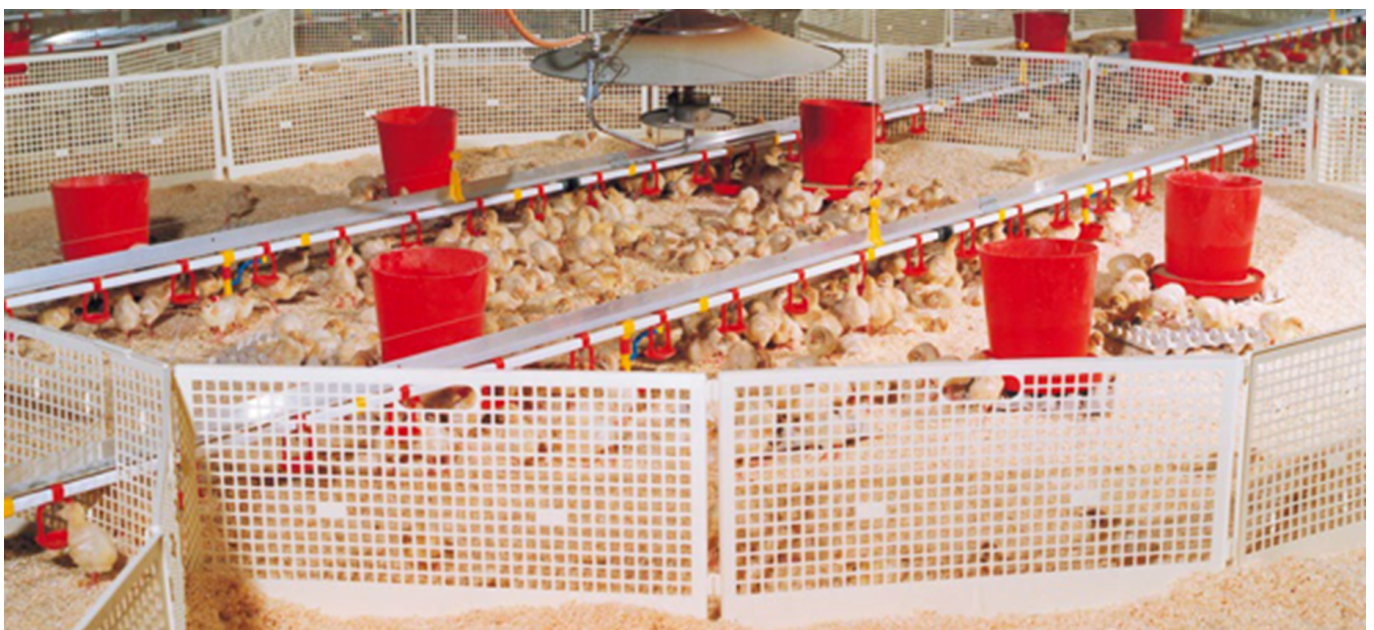
Temporary guards to confine chicks