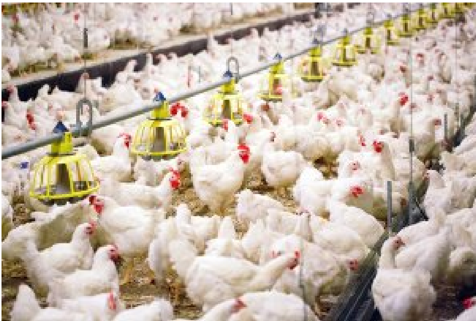
Relatively high stocking density is the norm in poultry production

The build-up of mucus in the respiratory tract severely reduces oxygen intake, causing breathlessness, reduced feed intake, and a drop in the birds' energy levels, which negatively impacts weight gain and egg production. Respiratory problems can result from infection with bacteria, viruses, and fungi, or exposure to allergens. The resultant irritation and inflammation of the respiratory tract leads to sneezing, wheezing, and coughing – and, therefore, the infection rapidly spreads within the flock.